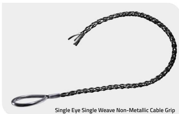
Single Eye Single Weave Non-Metallic Cable Grip