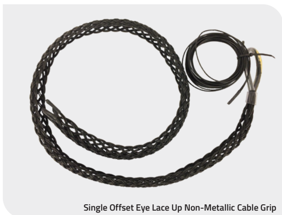
Single Offset Eye Lace Up Non-Metallic Cable Grip