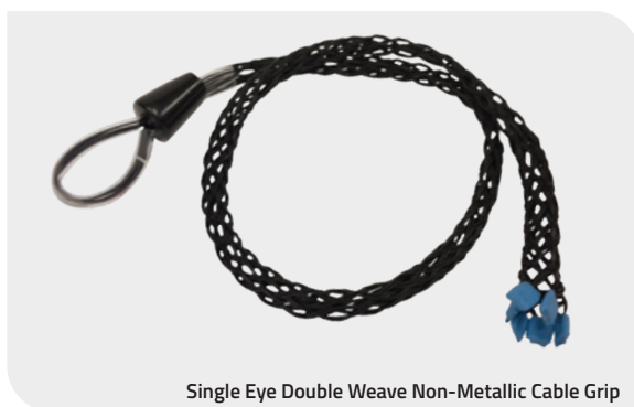
Single Eye Double Weave Non-Metallic Cable Grip