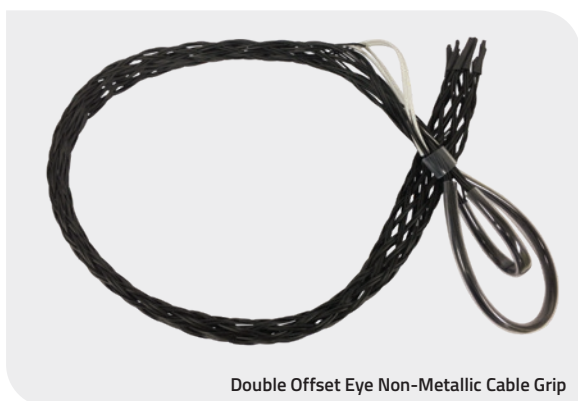
Double Offset Eye Non-Metallic Cable Grip