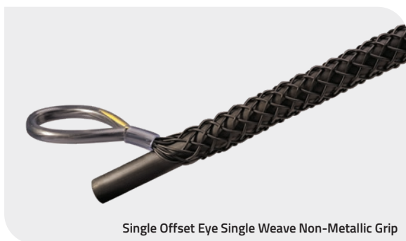
Single Offset Eye Single Weave Non-Metallic Grip