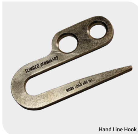
Hand Line Hook