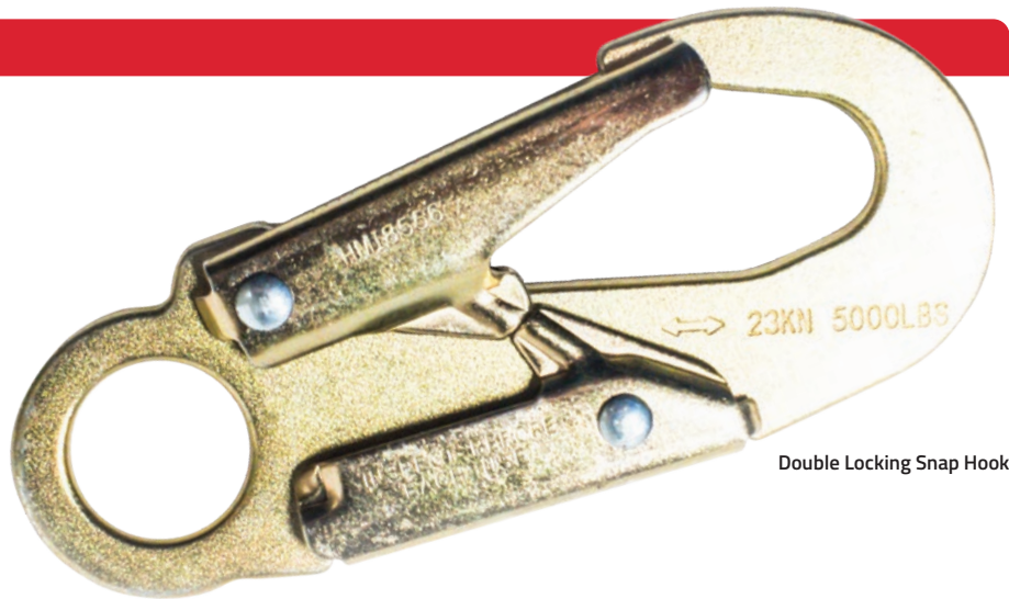
Double Locking Snap Hook

The Hand Line Hook is made of manganese bronze, and is made for use with 1/2" (12.7 mm) rope.