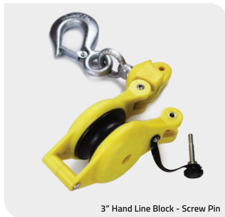
3" Hand Line Block - Screw Pin