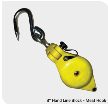
3" Hand Line Block - Meat Hook