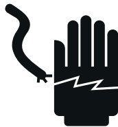
Not an Insulated Product