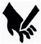
Pinch Point Warning