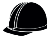
Hard Hat Required