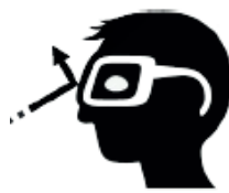
Safety Goggles Required